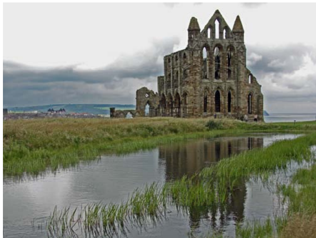
Whitby Abbey, Yorkshire, England

Cyril Harvey's photo exhibit at Friends Homes Guilford comes down in early December